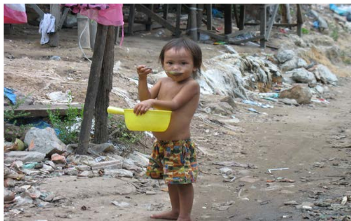
Adapting to no running water in the slums.

digital xray sensor which will be available in Sihanoukville from the start of December 2016. This will ensure more predictable anterior endodontics and better diagnostics for all procedures.