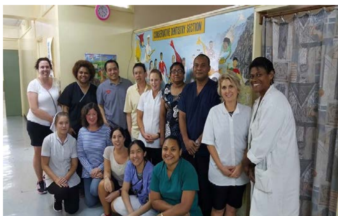
A volunteer visit by the Palmerston North dental practice - All 14 of them.

SFTP was founded in 2012, with the intent to provide free dental treatment to the under-privileged people of north western Fiji, including complex dental treatment and elimination of pathology. We are heavily involved in the up-skilling and training to all ranks of dental professionals in the South Pacific region.