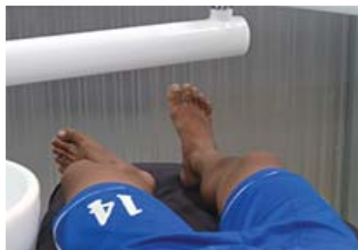
Glad that's over