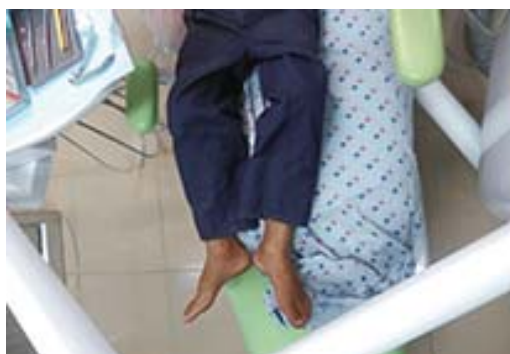
Relaxed but optional escape plan