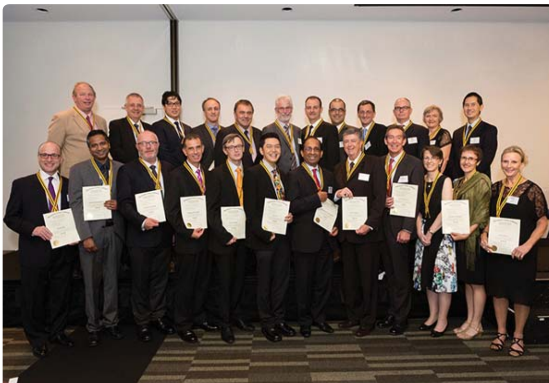
New Fellows inducted into the Australasian Section of the International College of Dentists

The Australasian Section of the International College of Dentists conducted an induction ceremony in Brisbane on the evening of Friday, March 27 at the time of the ADA Biennial Congress. The induction and dinner were attended by 120 Fellows and guests. 31 new Fellows were inducted into the International College.