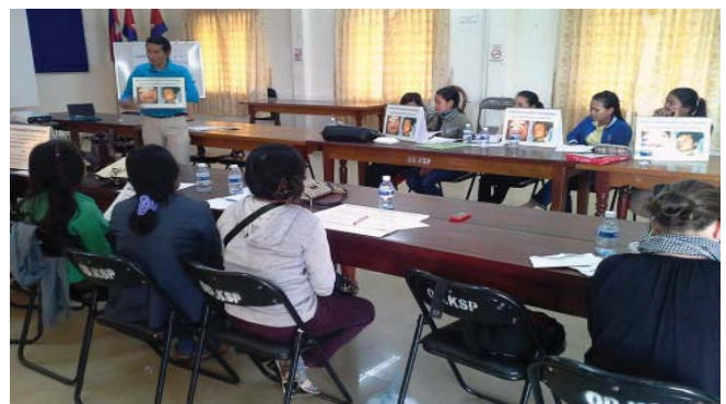
Training midwives in Cambodia

Caries experience in Cambodia is very severe and it starts at a very young age. By age six the average Cambodian child has nine untreated decayed teeth.