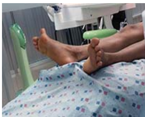
One toe lift off, not happy