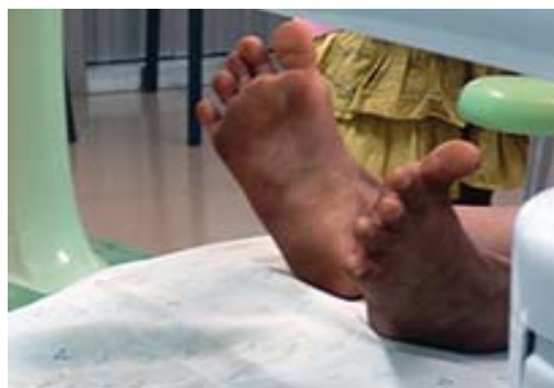
Wow, that was a surprise!