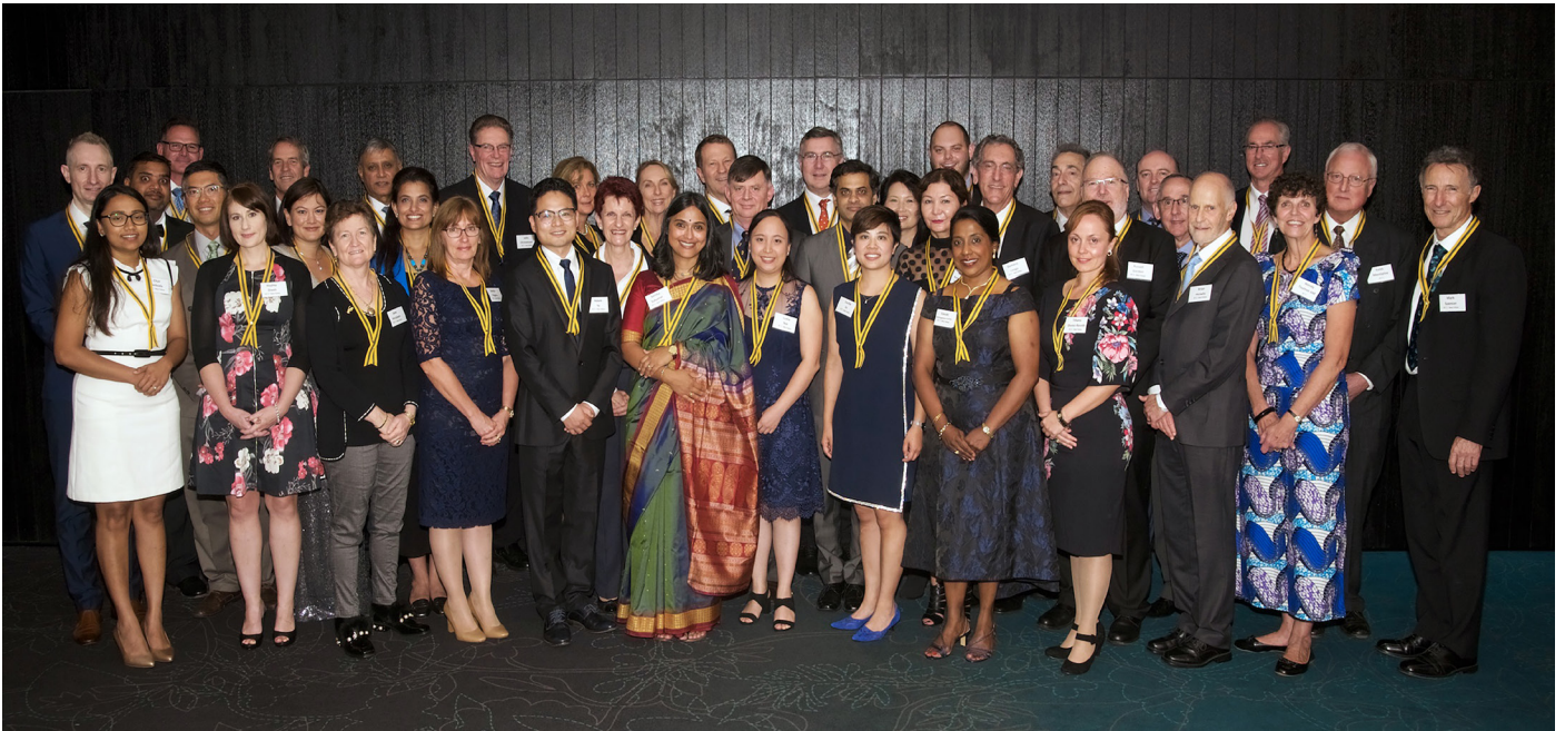
New ICD Fellows inducted at the Parkroyal Darling Harbour on 24th March 2018.

As advised in the President's Message in this newsletter, an ICD induction ceremony and dinner were held at the Parkroyal Darling Harbour on the evening of 28 March. Thirty-seven new Fellows were inducted on the night. Our congratulations go to: