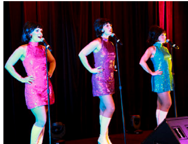
The evening concluded with dancing to the vocals of the Sassy Sisters and lots more catching up.