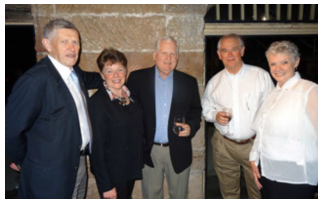
Welcome Reception for International Councilors The Waterfront Restaurant, The Rocks

The Council Executive expressed appreciation to the Section VIII Board for the organisation of the 2014 Council meeting and the Section VIII 50th anniversary events in Sydney.