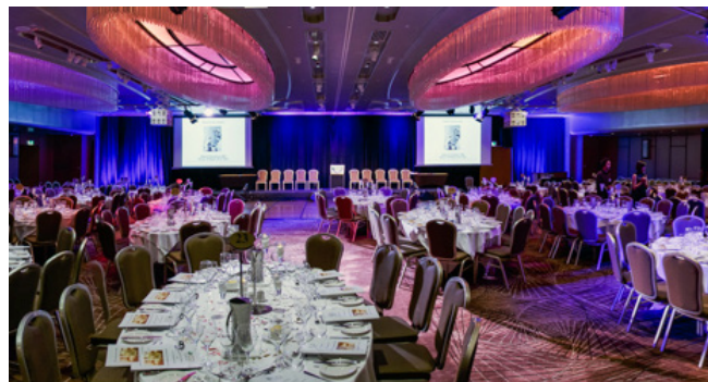
Grand ballroom, Shangri-La Hotel

The 50th anniversary celebrations culminated with an induction ceremony and gala dinner held in the grand ballroom of the Shangri-La Hotel on Saturday evening, October 25. There were more than 300 Fellows and guests in attendance. Fellows from New Zealand, from every state and territory in Australia and from Singapore travelled to Sydney for the occasion. We were also honoured to have many representatives from the International Council with us on the evening.