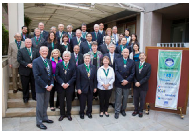
Council Executive Meeting Section VIII Board Meeting, October 23