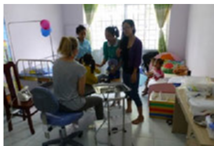
The latest team working with the new equipment