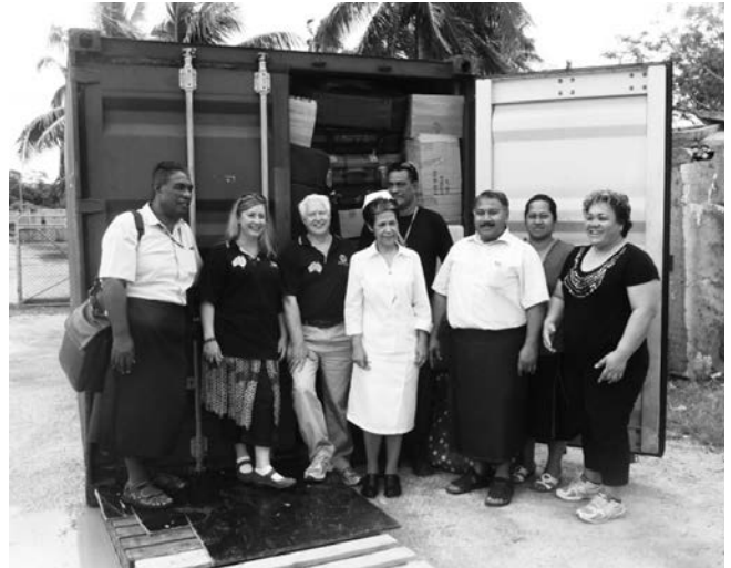
Opening the container with Medical and Dental staff

material assorted ambulance equipment, Diathermy tips, assorted consumables, oxygen masks and much more.