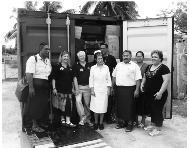
Opening the container with Medical and Dental staff

material assorted ambulance equipment, Diathermy tips, assorted consumables, oxygen masks and much more.