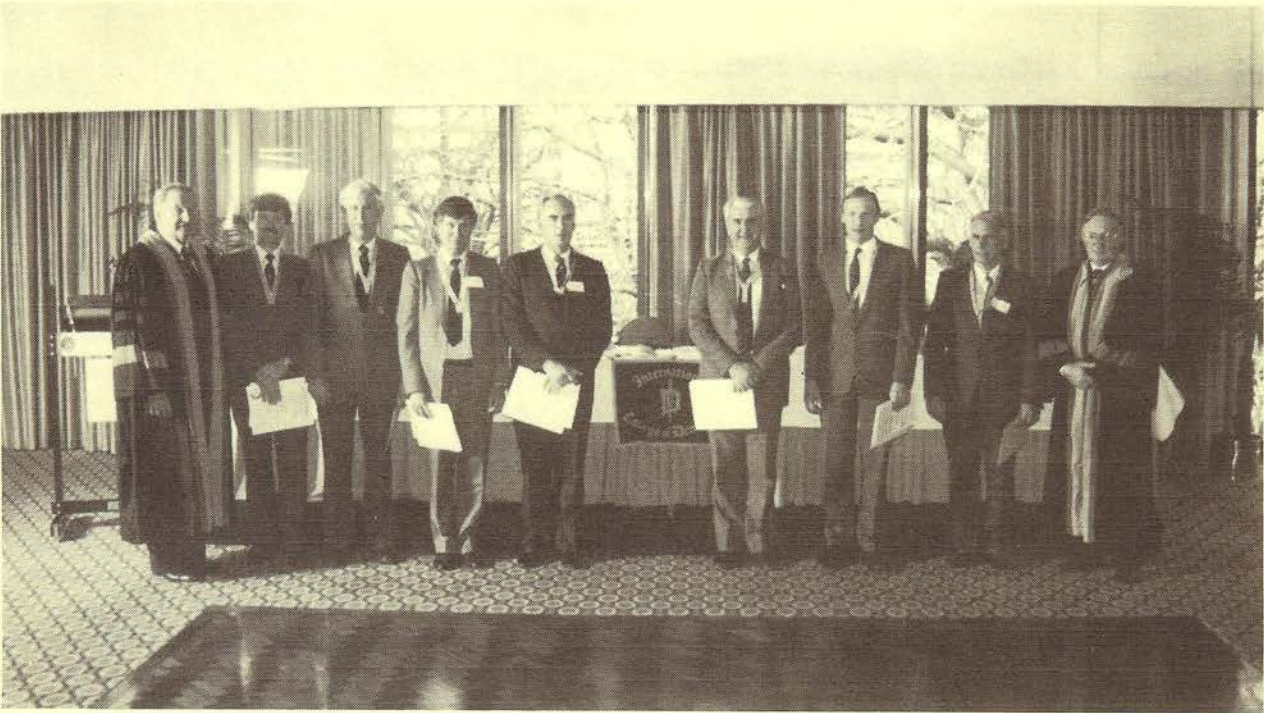
The President and Registrar with the seven new Fellows inducted at Christchurch last August.